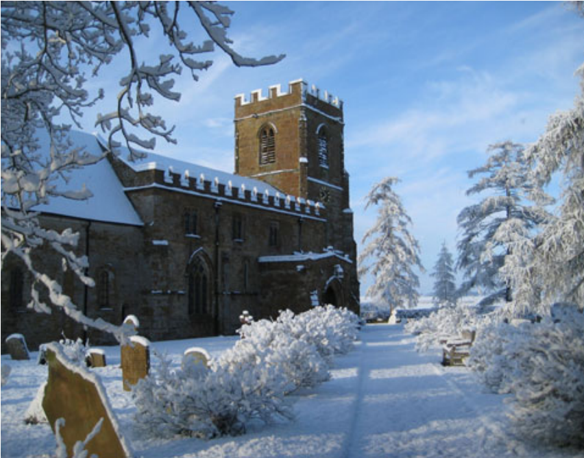
Our beautiful St Lawrence Church in snow.